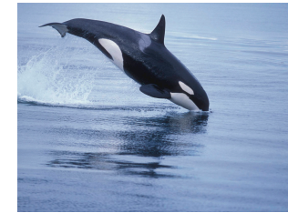
Transient killer whale porpoising after a chase and demise of a Dall's porpoise