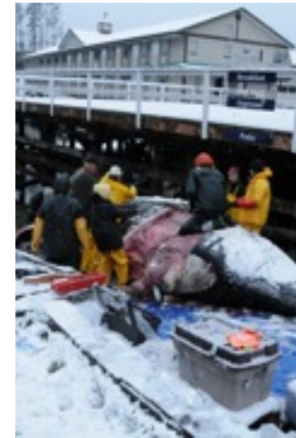
Necropsy in the snow April 1, 2009